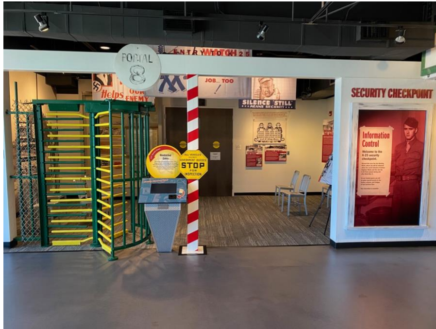
Entrance to the theater, first stop on your visit to the K-25 History Center

(As published in The Oak Ridger's Historically Speaking column the week of August 9, 2021)