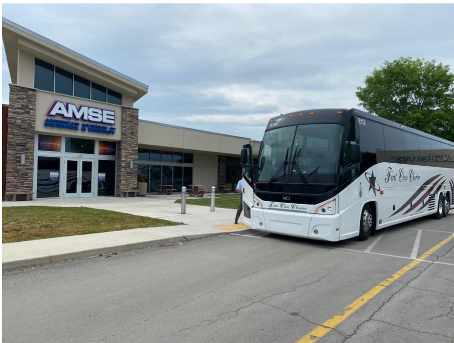
Tourist buses are coming to AMSE as well