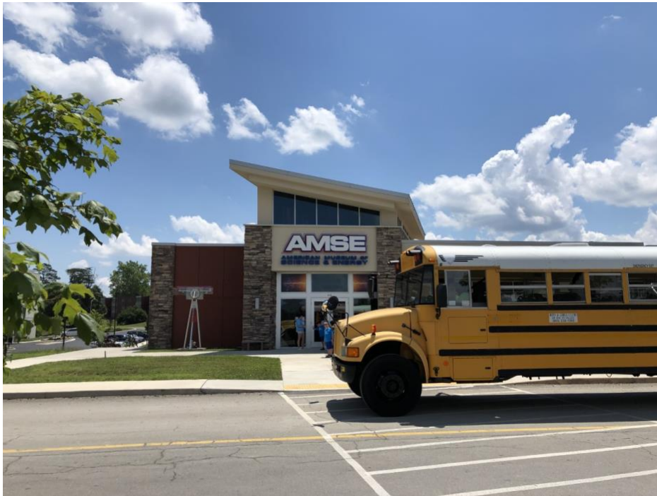
A welcome sight, school buses bringing children to the American Museum of Science and Energy

(As published in The Oak Ridger's Historically Speaking column the week of August 9, 2021)